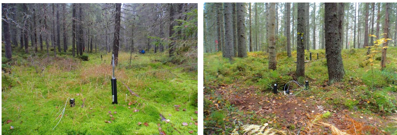
Figure 2. An example of GW discharge (left) and non-discharge (right) sites with riparian and transition wells. Pictures are taken standing in the stream.

We have installed GW wells at 11 pairs of GW discharge and non-discharge sites along 3 headwater streams within the Krycklan catchment (Fig. 1). For the site selection, a hydrological model of GW flow paths was created (A. Ågren, simplified version of the model on Fig. 1) and the GW discharge locations were visually confirmed in the field. At each site we installed 5 GW wells in total (Fig. 1), at three distances from the stream, i.e., 3 m (two riparian wells), 10 m (two transition wells) and 20-30 m (one upland well). The wells were installed in depth between 50 and 200 cm, based on local soil structure and depth to bedrock. For the paired wells (i.e., riparian and transition), one well is used for GW sampling and one well for water level and temperature monitoring. Due to instrument failures we were not able to continuously monitor GW levels and temperature, however new instruments will be installed shortly (TrueTrack water level loggers, New Zealand). The GW wells installation was finalized in August 2015 (example on Fig. 2). The wells are installed permanently and will continue to be monitored in the coming years.